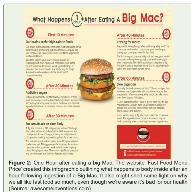
Figure 2: One Hour after eating a big Mac. The website 'Fast Food Menu Price' created this infographic outlining what happens to body inside after an hour following ingestion of a Big Mac. It also might shed some light on why we all like fast food so much, even though we're aware it's bad for our health.