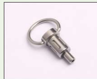
Figure 3: L'il One Driver (FavAnchorTMSAS, India).