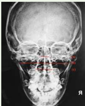
Figure 5: 'Comparison of skeletal parameters.