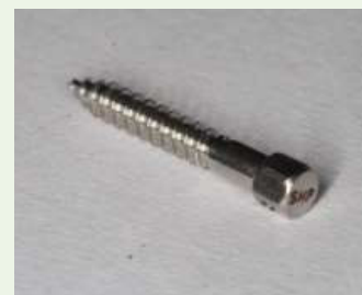
Figure 4: "Medusa" Screw (FavAnchorTMSAS, India).